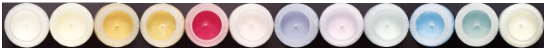
French Vanilla Rain Mandarin Spice Cinnamon Stick Cape Cod Cranberry Mayflower Evening Jasmine Spring Garden Snowflake Celestial Garden Siberian Fir Mist

Our Crackle Glass Jars are made with a blend of soy and other natural waxes for a sootless, long-lasting burn. Available in twelve of our most popular fragrances, these beautiful jars have a peelable label.